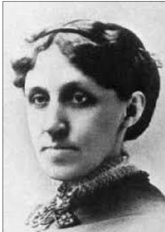
Louisa May Alcott

After using her family connections to see the governor of Massachusetts about free train passes, Alcott found herself at Union Hospital in the Washington, DC area. On her fourth day at the